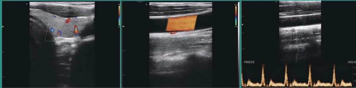
Thyroid C Mode