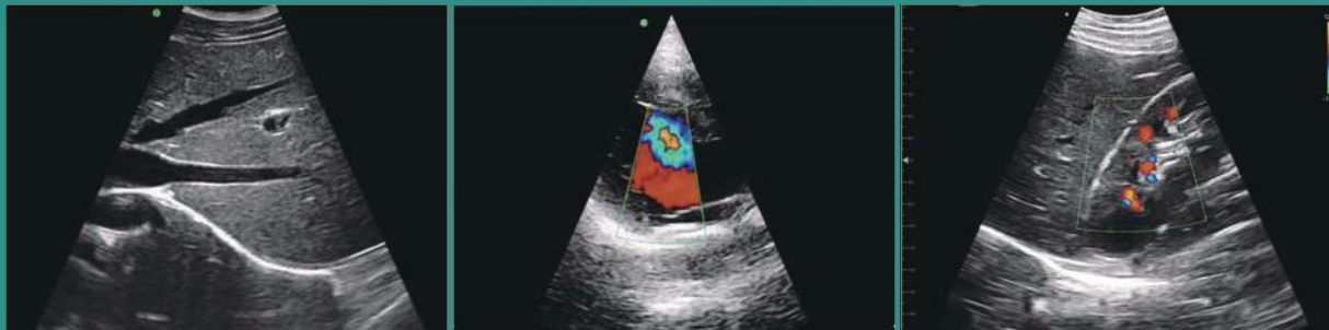
Liver B Mode